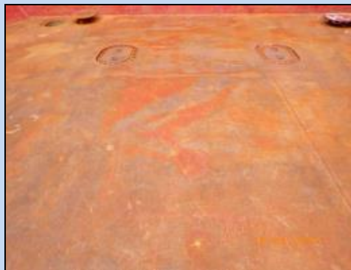
5. Tank Top Closeup