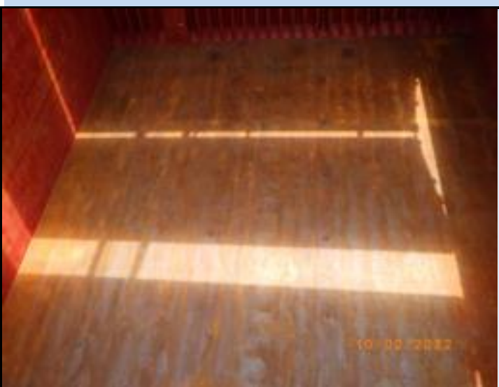
5. Tank Top