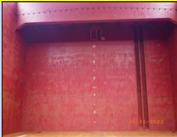
2. Aft Transverse bulkhead