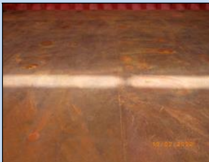
5. Tank Top Closeup