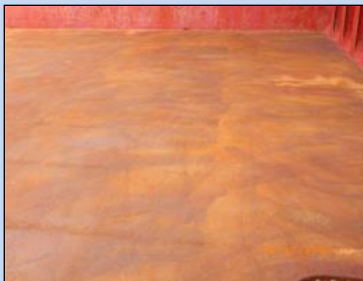
5. Tank Top Closeup