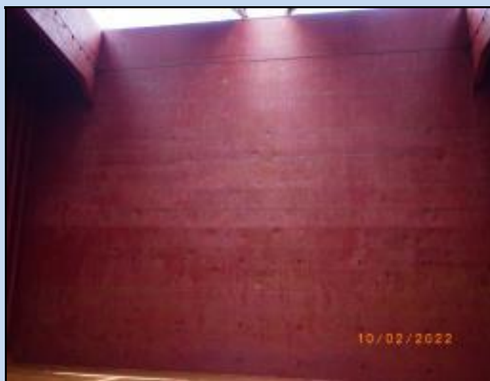
4. Stbd side plating and tank top