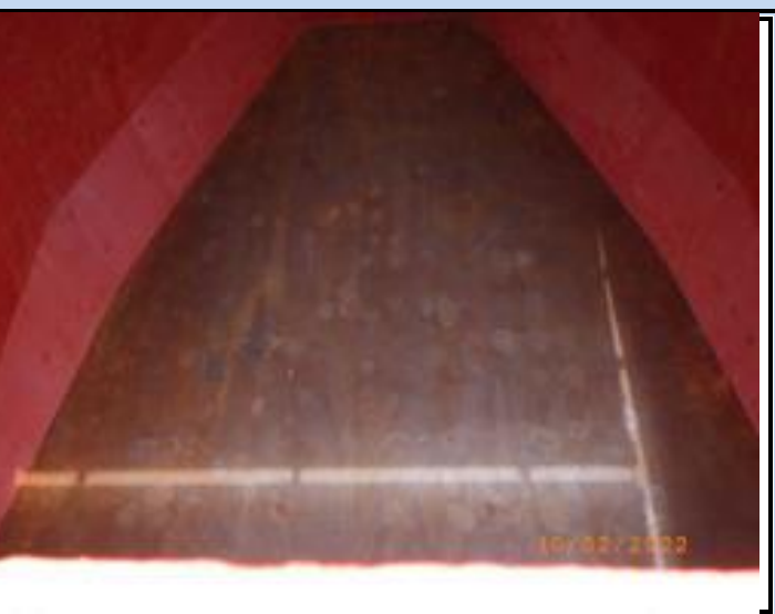
5. Tank Top