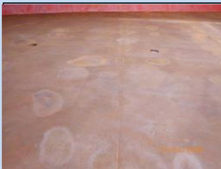
5. Tank Top Closeup