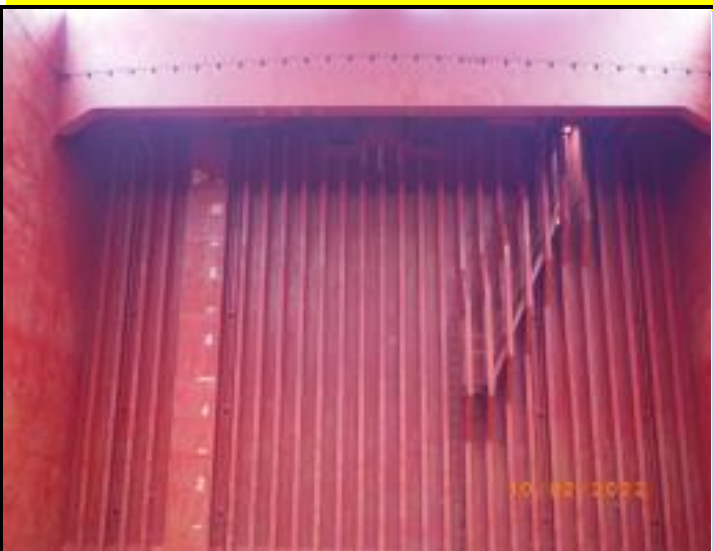
1. Forward Transverse bulkhead