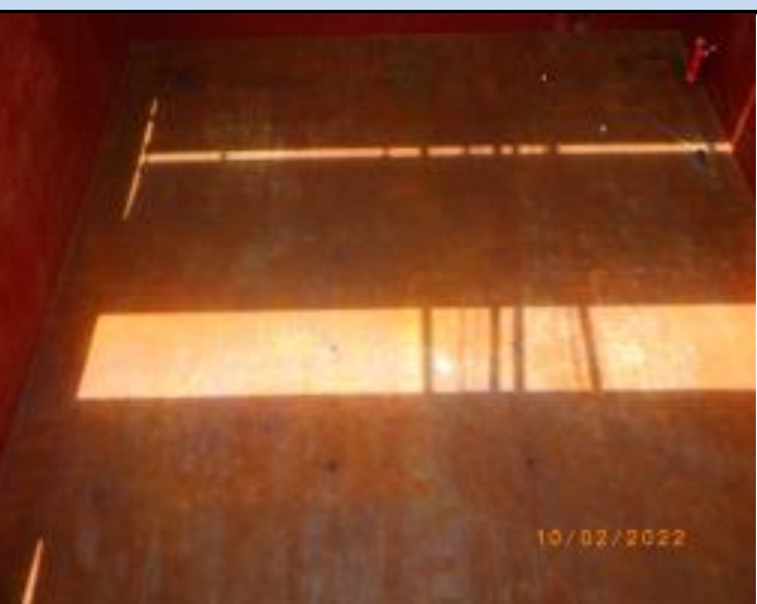
5. Tank Top