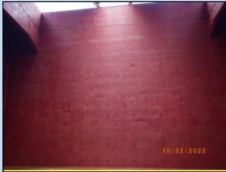
4. Stbd side plating and tank top