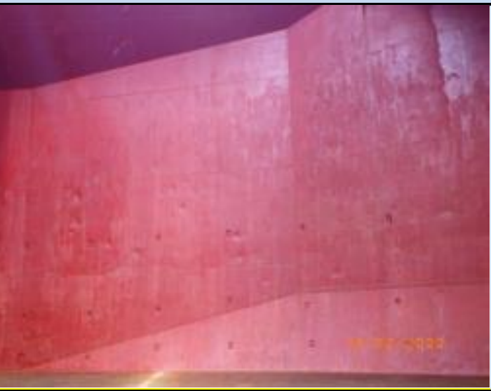
3. Port side plating and tank top