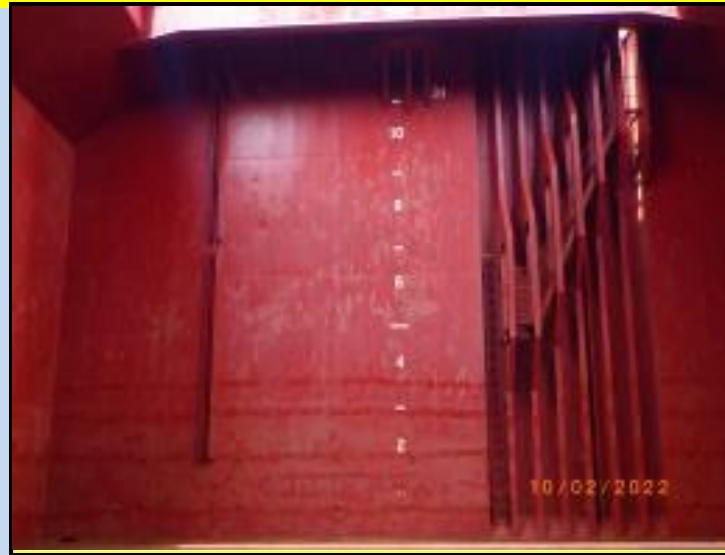
2. Aft Transverse bulkhead