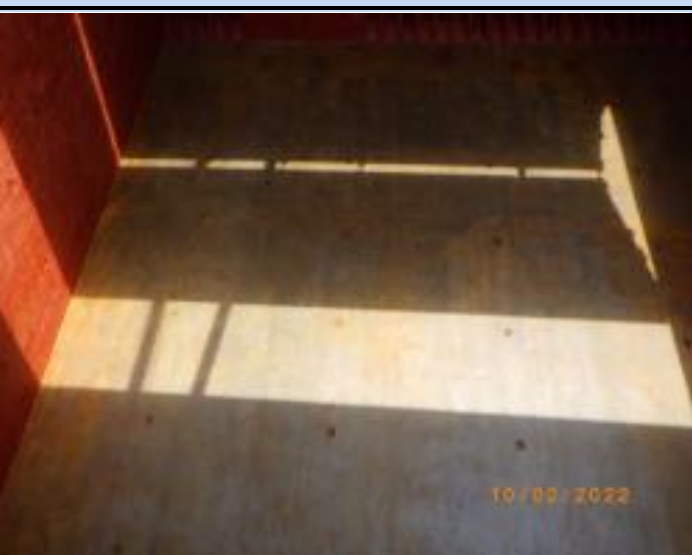
5. Tank Top