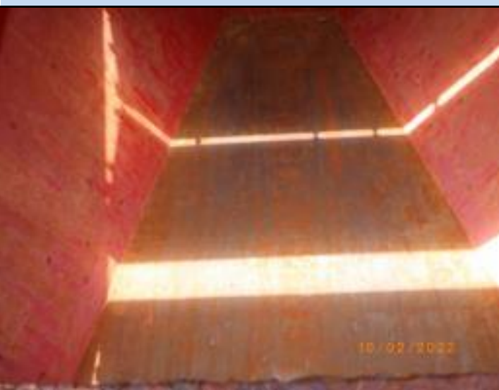
5. Tank Top