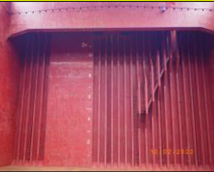
1. Forward Transverse bulkhead