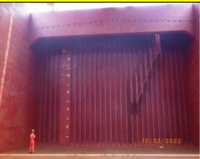
1. Forward Transverse bulkhead