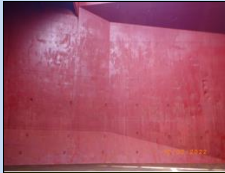
4. Stbd side plating and tank top