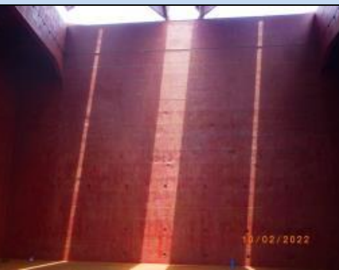
3. Port side plating and tank top