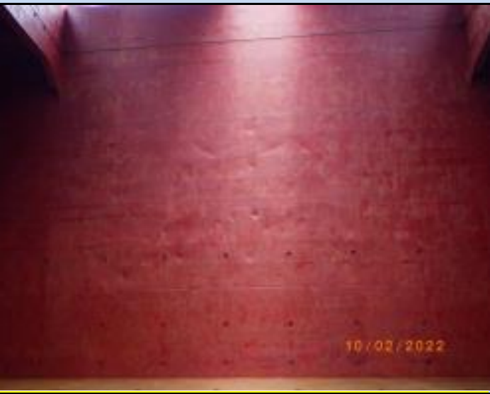
3. Port side plating and tank top