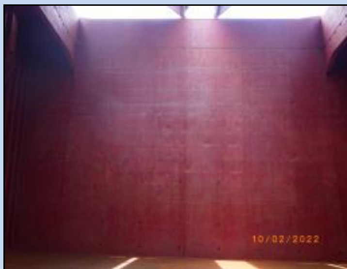
4. Stbd side plating and tank top