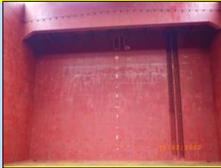
2. Aft Transverse bulkhead