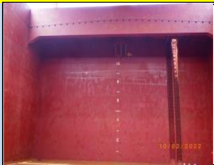
2. Aft Transverse bulkhead