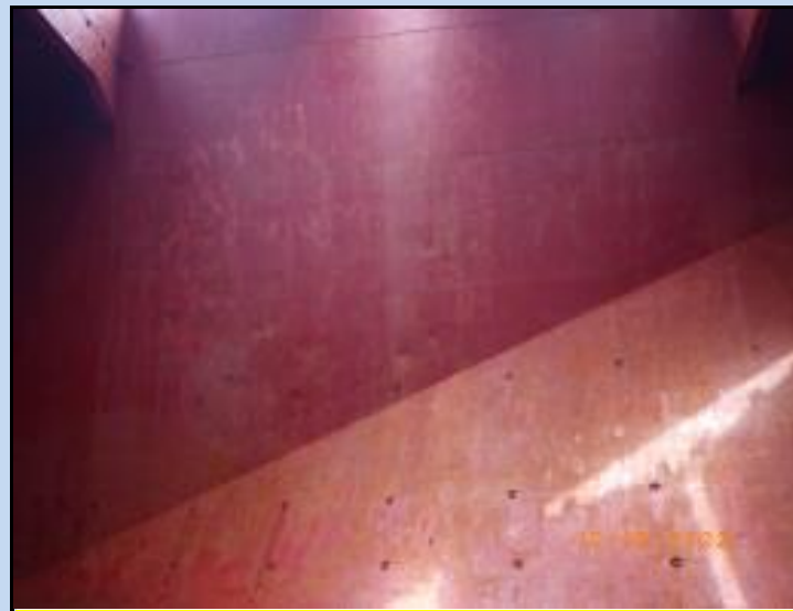
4. Stbd side plating and tank top