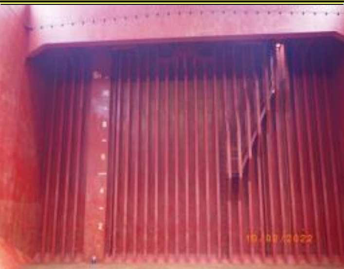
1. Forward Transverse bulkhead