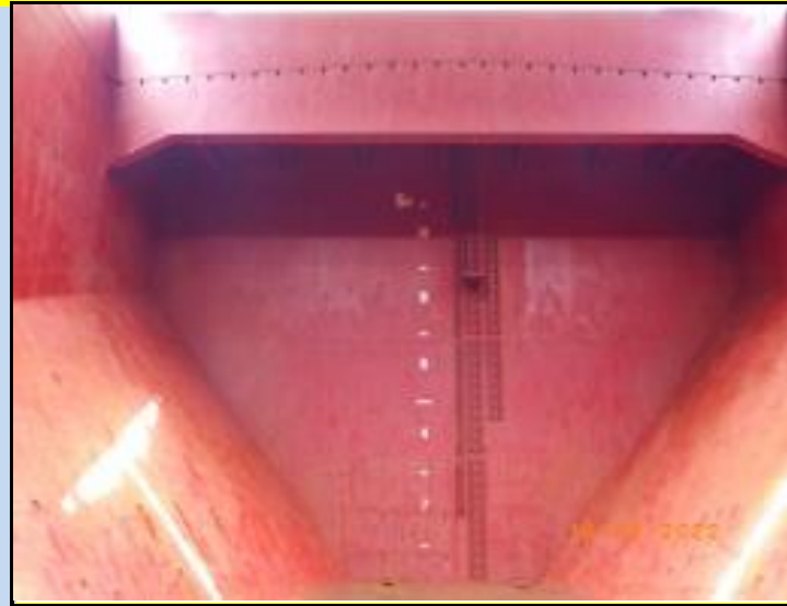
2. Aft Transverse bulkhead