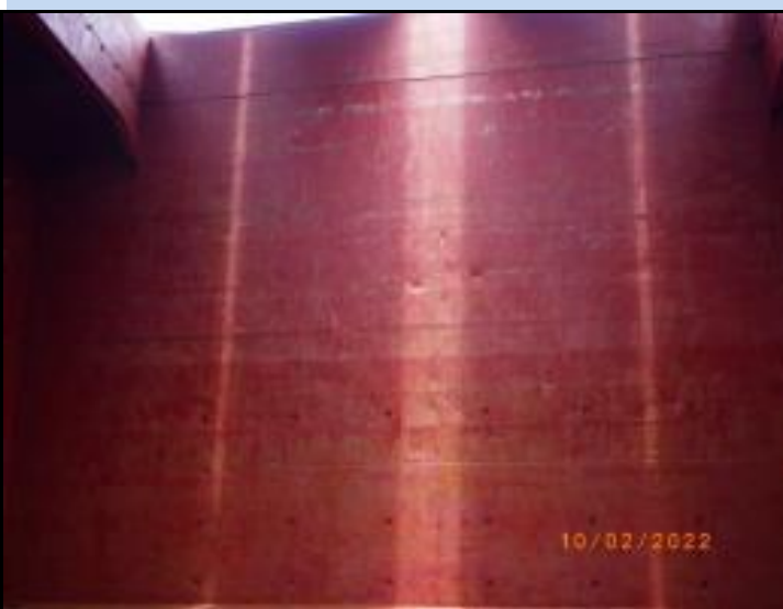
3. Port side plating and tank top