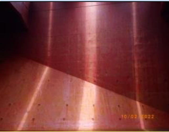
3. Port side plating and tank top