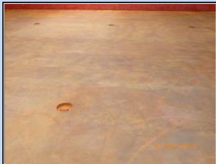
5. Tank Top Closeup